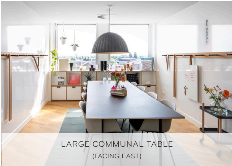
LARGE COMMUNAL TABLE (FACING EAST)