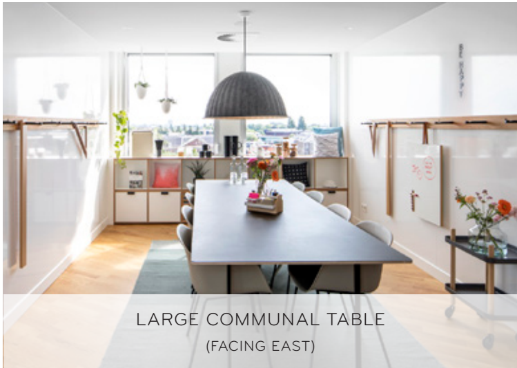
LARGE COMMUNAL TABLE (FACING EAST)