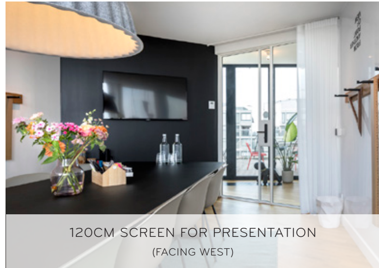
120CM SCREEN FOR PRESENTATION (FACING WEST)