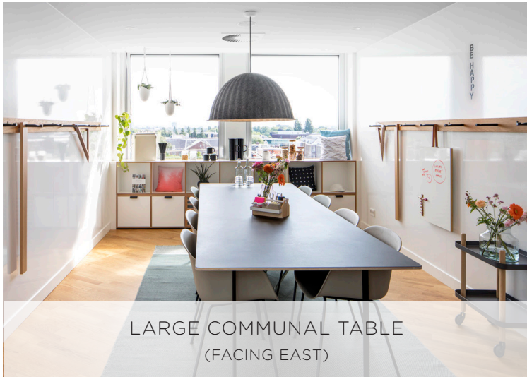
LARGE COMMUNAL TABLE (FACING EAST)