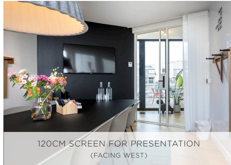
120CM SCREEN FOR PRESENTATION (FACING WEST)